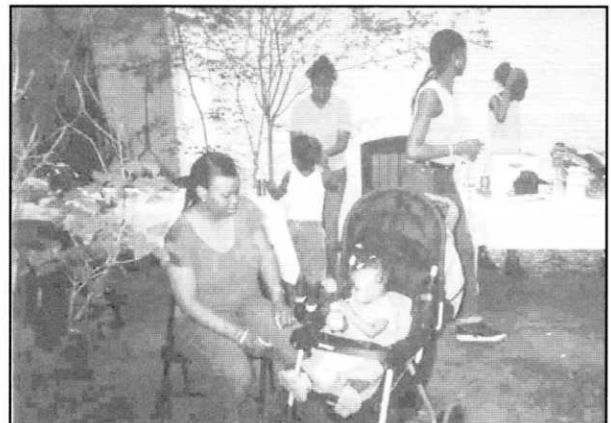
Family at AVP picnic