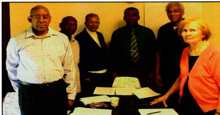
Church of Gethsemane Session