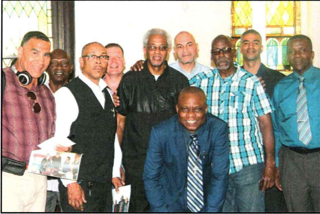
Project Connect Re-Entry Group

Upon release Project Connect Members are welcomed into the Church of Gethsemane. Here they can receive assistance with counseling, food, clothing, emergency funds and referrals for housing, job placement and health care benefits. The Project Connect Re-Entry Peer Support Group is open to returning PC Members and those outside the Church community who have been recently released from prison. The support group provides a forum for individuals to discuss specific issues and concerns relating to transition from prison to life on the outside. Participants are urged to share their joys and struggles and learn from each other's experiences. Together group members become involved in problem solving and networking and provide feedback and support for each other. A meal and roundtrip transit fare are provided to each participant. The group meets twice monthly and occasionally invites outside speakers. Discussions are kept confidential.