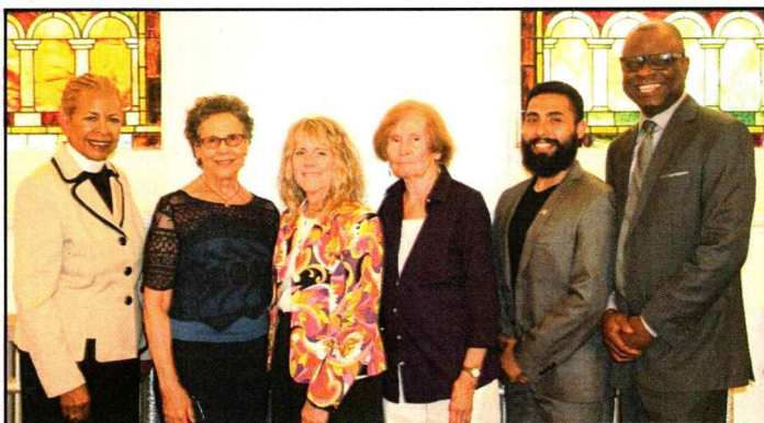
Church of Gethsemane Staff